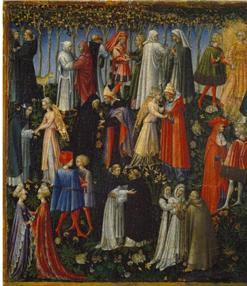
Giovanni di Paolo' (joh-VAHN-ni DEE-pow-loh) 1445 Paradise