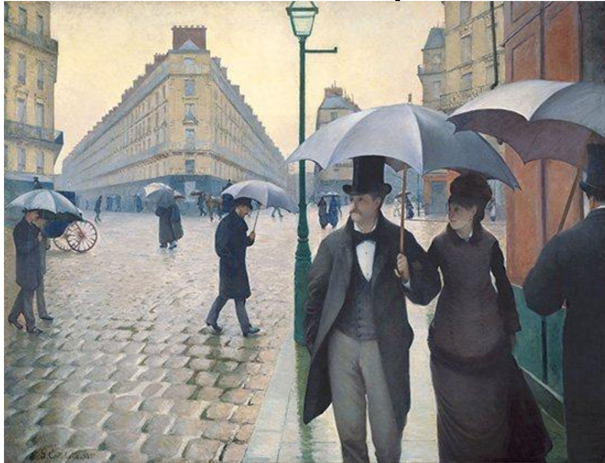
Gustave Caillebotte, Paris Street in Rainy Weather , 1877, Art Institute of Chicago, oil (?)