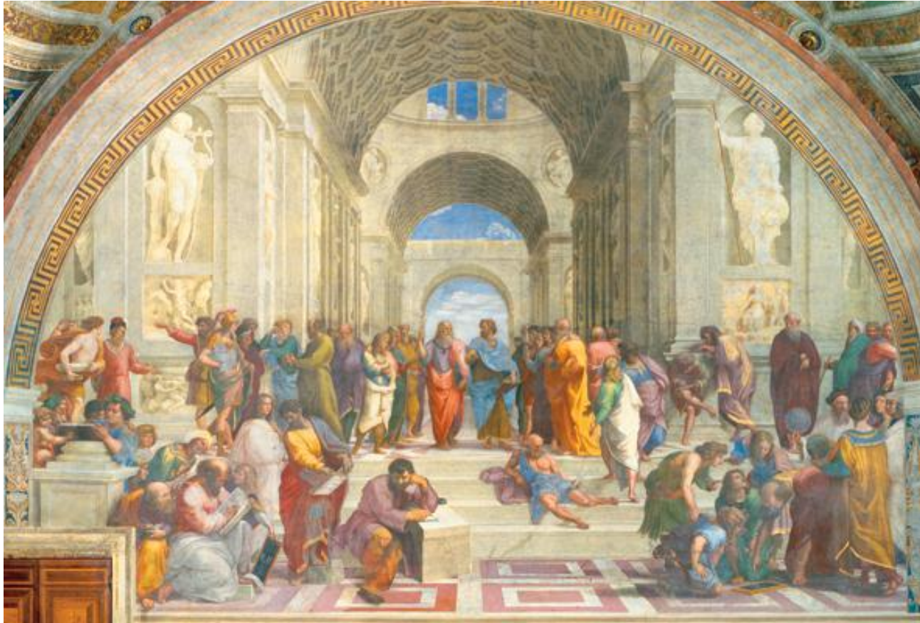
The School of Athens, Raphael, 1509, FRESCO